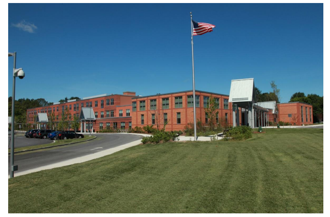
Francis T. Bresnahan School Preschool Information Night